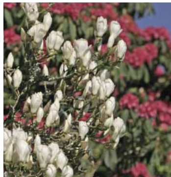
Magnolia x soulangiana (rhododendron behind) (Terry Underhill)

Rescuing this splendid garden is an important part of the Titcheners' plans - albeit also a financial drain. Money generated from the development of the outbuildings as luxury self-catering accommodation will