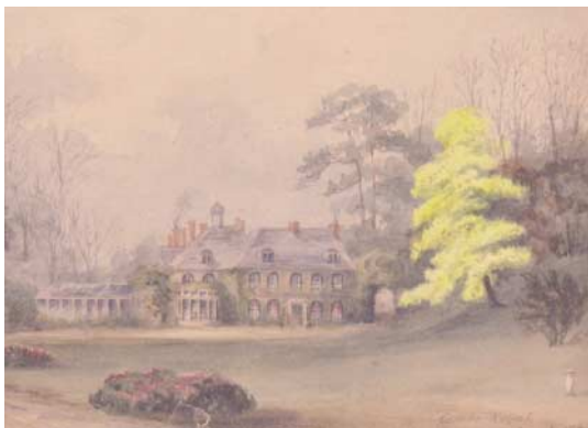
Watercolour of Combe Royal, dated 1859 but depicting the earlier house (reproduced by kind permission of John Elliot)

The Combe Royal estate (spelt historically with one 'o'), near Kingsbridge in South Devon, occupies a very favourable site above the town of Kingsbridge, at the head of the Salcombe estuary. The sheltered valley, nearly three hundred feet above sea level but protected from the prevailing south-westerly winds and blessed with spring-fed streams and ponds, is well-suited to the growth of exotic plants. The estate was acquired by the Luscombe family in the early eighteenth century. Polwhele describes the main house, Combe Royal, as 'a modern-built house'; 1 and today it appears largely Victorian, as the house was much altered in the mid-nineteenth century. Major improvements were undertaken in the garden by the Luscombes during the nineteenth century.