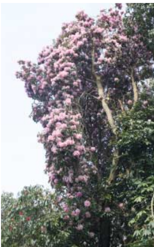
Rhododendron arboreum (Terry Underhill)

and unusual trees and shrubs are revealed at every turn: there is a Judas tree ( Cercis silquastrum ), a silver fir and a Japanese elm ( Ulmus davidiana japonica ), for example. The rhododendrons and camellias (over a hundred varieties) are flourishing, and some of the specimen trees and shrubs from the nineteenth century plantings are now amongst the largest of their species in Britain (there are fifty foot high rhododendrons). However, many of them were planted too close together initially and, responding enthusiastically to the mild climate and plentiful water supply, have outgrown their space. Even in 1904, the Gardeners' Chronicle noted: 'Here [in the deep dell or American Garden] were also trees of Sequoia gigantean , some 60 feet high, with stems about 4 feet 6 inches through at the base; the plants are, however, much injured by the proximity of some trees of Araucaria imbricatæ . 5