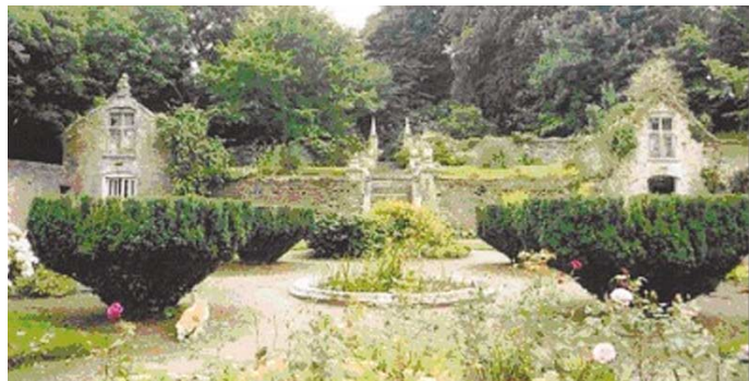
The Fountain Court (Susi Batty)

the 1840 tithe map and the 1887 Ordnance Survey map all depict the space divided into four with a central pool.