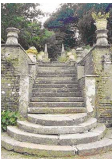
Steps up to the middle terrace (Susi Batty)

Without the statues the Fountain Court is dominated today by a charming pair of brick gazebos, shown in the painting as having ogival pyramid roofs with central decorative finials. Originally single storey, gables were added in the C19 to raise the height and create an upper floor. New windows were inserted above, doors punched through on the first floor from the terrace above, and the mullion and transom windows in the outer garden walls, identified in the painting, blocked up. The decorative balls and finials which are on the apex of the front gables today match many in the painting and, if not reduced from the original roof (they are less ornate), are possibly from elsewhere in the garden.