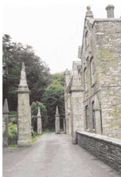
The double gate piers (Susi Batty)

It is to the south side of the house where most of the older garden can be found today. Two impressive double pairs of square, C17 granite ashlar gate piers with pyramidal obelisk tops guard both ends of the south front of the house. A central flight of seven shallow steps leads to a quite remarkable survival: an enchanting late C17 or early C18 brick-walled, formal, terraced garden, described in the gardener's lease as 'The Gardens before the Parlour Windows of the Dwelling House there commonly called the Fountain Garden'. The first, and largest, terrace contains a central stone pool and a pair of exquisite gazebos; axial steps lead up to two further smaller terraces and a woodland garden beyond.