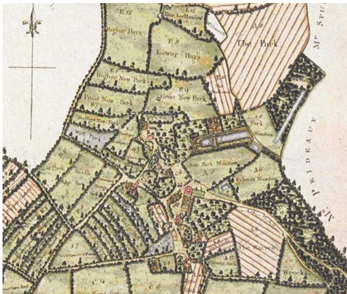
Detail of Langdon Court Estate Map, 1788-89

Using information from these it has been possible to decipher the fragmented landscape of the C21 and unravel much of what was present in the early garden. The painting, anonymous but probably executed by a peripatetic artist, is crammed with details; and, although the perspective is awkward and not a true rendition of the landscape, has considerable naïve charm. The lengthy poem contains much real information about the garden buried within its cumbersome iambic pentameters. It fits into the genre of country house and garden instruction poems (frequently sycophantic and of doubtful literary merit) common in the C17 and C18. 5 The hand-coloured map for Langdon Court illustrates the precise layout of the estate.