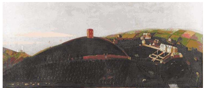
Anonymous painting of Langdon Court, c. 1707, oil on panel, 63.5 x 141.5 cms

Susi Batty (Based on an article first published in Studies in the History of Gardens and Designed Landscapes , Vol 26, No.3, July - Sept 2006)