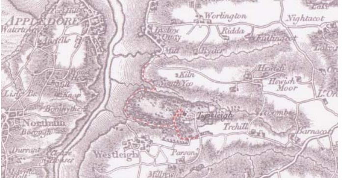
Ordance Survey map, 1809

The 1890 O.S. map<sup>4</sup> depicts the layout of the parkland in great detail and many of the features shown survive today. These include the ice-house, walled garden, kennels and the brick-built orangery or dairy building.