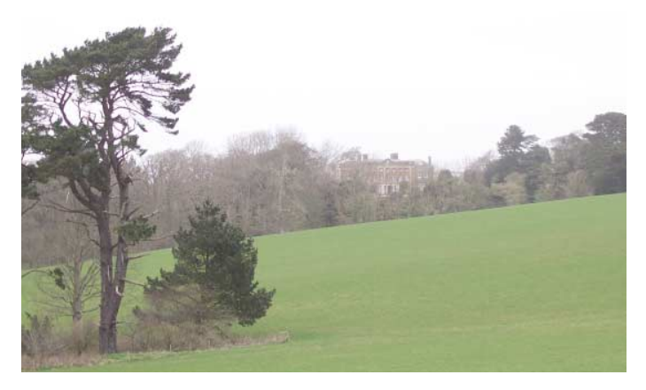
View towards the house today (Rosemary Lauder)

None of this would have been visible from the house, because the ground is ramped up to the height of the wall, some four to five feet. From the house, therefore, the view would have been down a grass slope and, without any interruption, out across the parkland to the copse and adjoining plantations (the estate once contained many copses, planted with pines, of which only a few trees have survived). The print of Tapeley by Ferdinand Berhaus, dating from around 1800, shows the house in just such a setting.