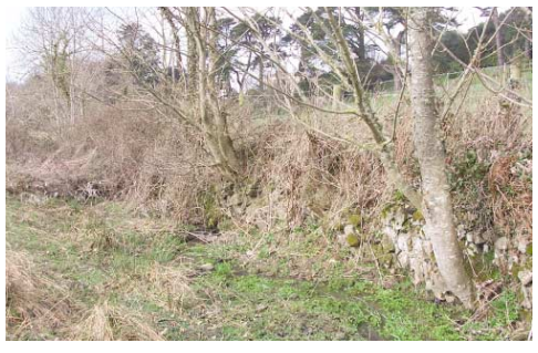
Remains of ha-ha (Rosemary Lauder)

Opposite the house are the remains of a small clump of trees, shown on the 1890 map; and some of the parkland trees shown in the fields and banks. The long field to the east of the back drive is edged by the long line of Oakbear Copse bordering the public road, and a narrow belt of ancient oaks connecting with East Plantation. From this area, the copse in front of Tapeley is the focal point, being planted on the highest ground before it falls to the river. There is evidence of an old track winding through the Oakbear Copse, which is a mixture of oak and beech, with many tree stumps and fallen pines. This could have linked up with the main drive, as the two cottages at Blackgate are twentieth century. The back drive, from Blackgate Cross, is now bordered by railings, but the field to the west rises in height, retained by a cobbled bank, so that the drive would be hidden from the terrace in front of the house. Gate piers once marked the entrance to the grounds, and by turning left (west) at this point, evidence of a ha-ha is found. This takes the form of a ditch containing a small stream, bounded by a wall on its north. This is of rough stone until it reaches the area immediately in front of the house, where it is built of regular stone, with two small semi-circular piers.