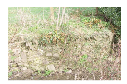
Detail of semicircular pier in the ha-ha (Rosemary Lauder)