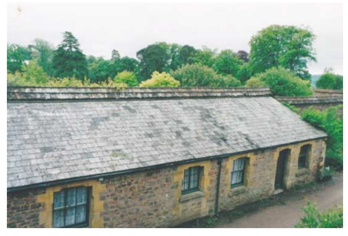
Bothy at Knightshayes Court

Bothy men received an allowance for fuel and vegetables as part of their wages. They supplemented their food with a bartering system with estate staff, or by poaching after dark to supplement their meals with rabbits, pheasants and duck. The gamekeepers turned a blind eye in return for fruit and vegetables. This system worked with the dairyman, where eggs and cream were swapped for garden produce, and with the kitchen staff where flowers and hothouse fruit were exchanged