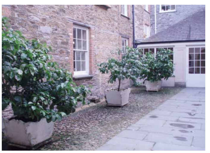
The Tudor courtyard at Saltram (Carolyn Keep, 2008)