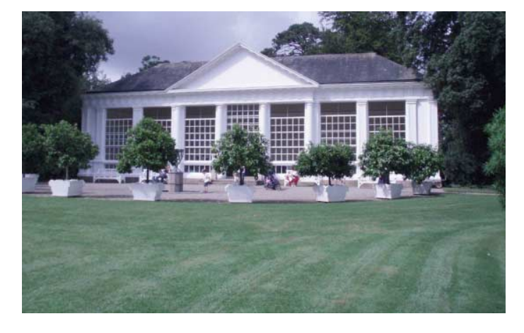
The Orangery at Saltram (Carolyn Keep, 2008)

At Saltram, however, oranges flourish: ten trees in superb wooden tubs form a half circle in front of the vast Orangery; and the display continues both in the small Tudor courtyard and in the orange grove. Graceful white Chinoiserie tubs, redolent of the mid-eighteenth century, add to the enchantment.