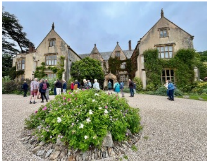
The Pig at Combe