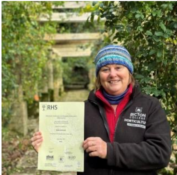
Successful bursary applicant The Italian Garden