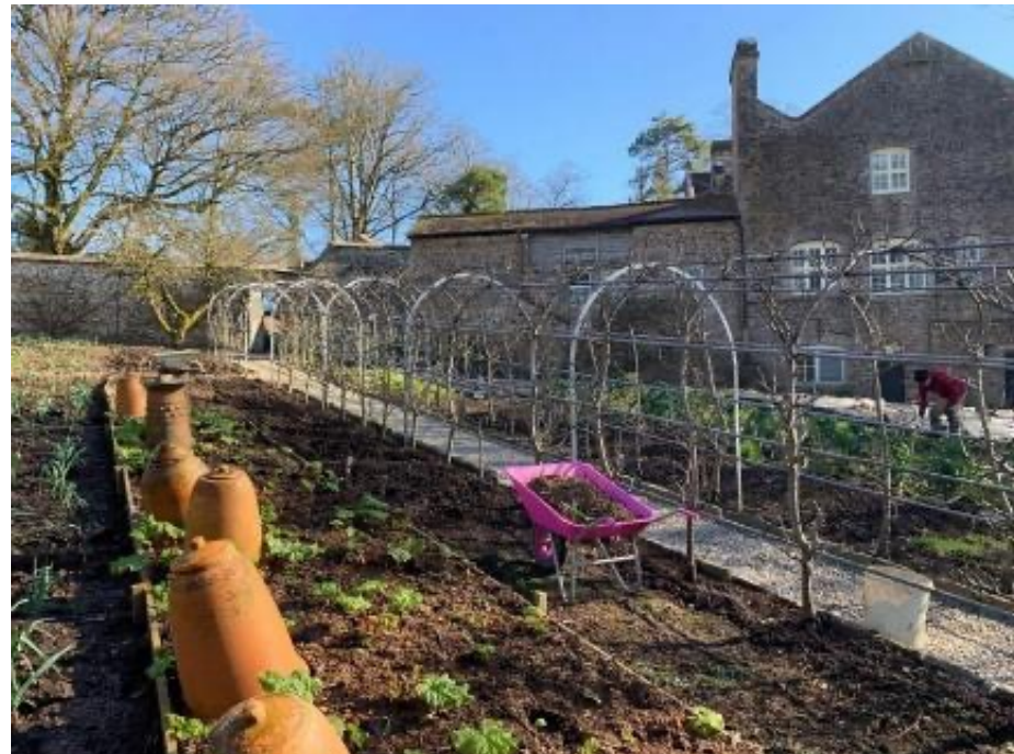
Farms for City Children Nethercott House