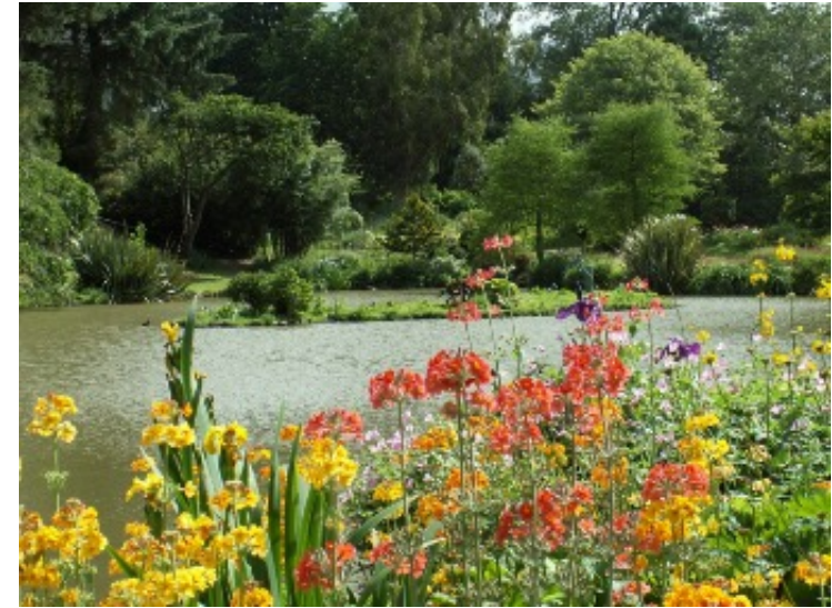
Marwood Hill Gardens