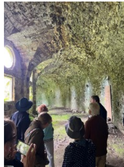
Old Stables at Stover School