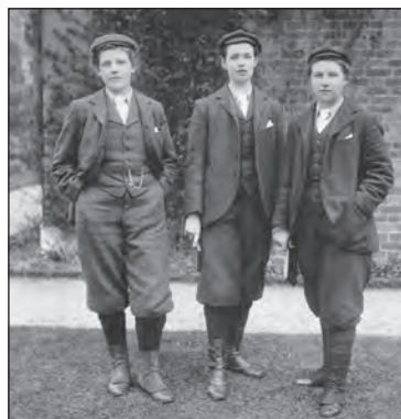
Figure 1. Lady Gardeners. (KGU/1/9/3/262)