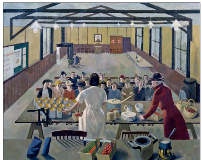
Figure 4. A Canning Demonstration , Evelyn Mary Dunbar, oil, 1940. © Imperial War Museum (Art.IWM LD 765).