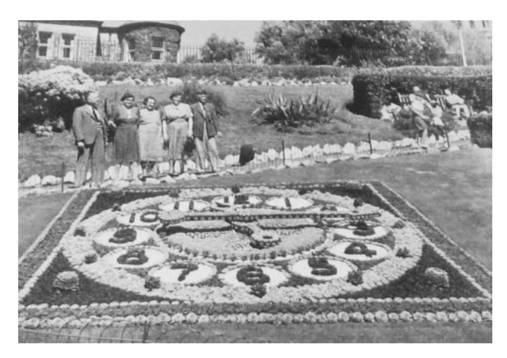
Floral Clock, Greenhill Gardens, (c.1960).

Today the boundary of Greenhill remains unchanged but there have been alterations within the Gardens themselves, with the rising ground now retained by low stone walls of differing heights and constructions rather than the high clipped hedges of the last century. It has one of the few remaining floral clocks in the country today.