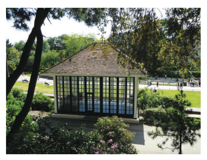
The Bandstand with the River Bourne and the Lower Gardens behind it. (2014).

Between 1845 and 1859 Decimus Burton was instrumental in the design of the Westover Gardens, which are on the eastern side and featured general wooded areas and paths, including the pine-lined Invalids' Walk, named to highlight its suitability for the weak and infirm. This shaded promenade provided an attractive area for early visitors. To the west of this walk there is a bandstand, the original being of a rustic nature. Rather than being in the normal setting of the centre of the Gardens, it is sited unusually right under the walk with the River Bourne between it and the Lower Gardens.